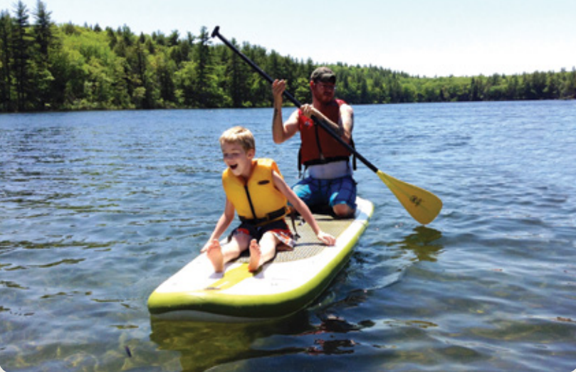
Spaulding Youth Center is a 501(c)(3) organization. Charitable donations are tax deductible to the extent allowed by law.